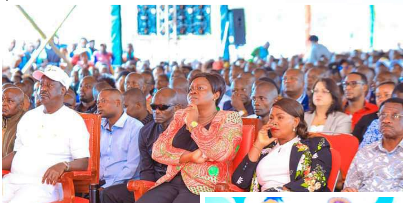
Rt. Hon Raila Odinga, Governors Gladys Wanga, Wavinya Ndeti and James Orengo follow the plenary session on day two of the conference

he second day of the Homa Bay International Investment Conference was marked with speeches from the Azimio Coalition leadership, former and current governors as well as other sector players and policymakers. The undertone of the speeches was both praise and persuasion, as all lauded Governor Wanga for not only putting up the conference but also leading the way in showing how a county can be transformed for the better when there is right leadership at the top.