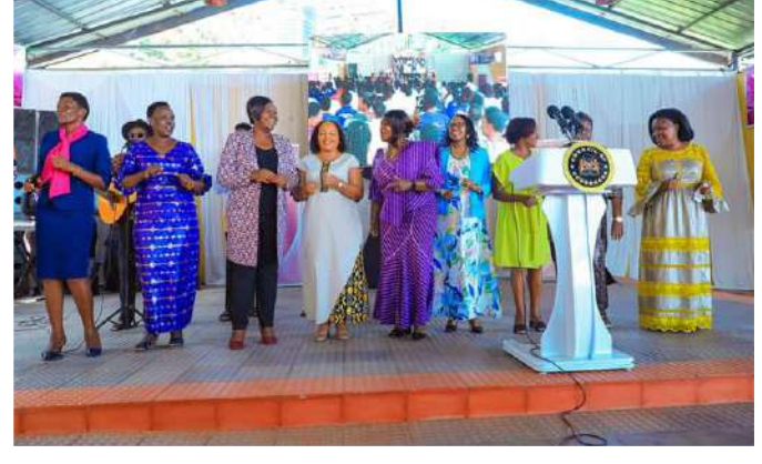
CoG Chair and Kirinyaga governor Anne Waiguru inspects a guard of honour on her arrival for the G7 launch

The G7 Strategy also espouses the women governors' agenda of increasing their number