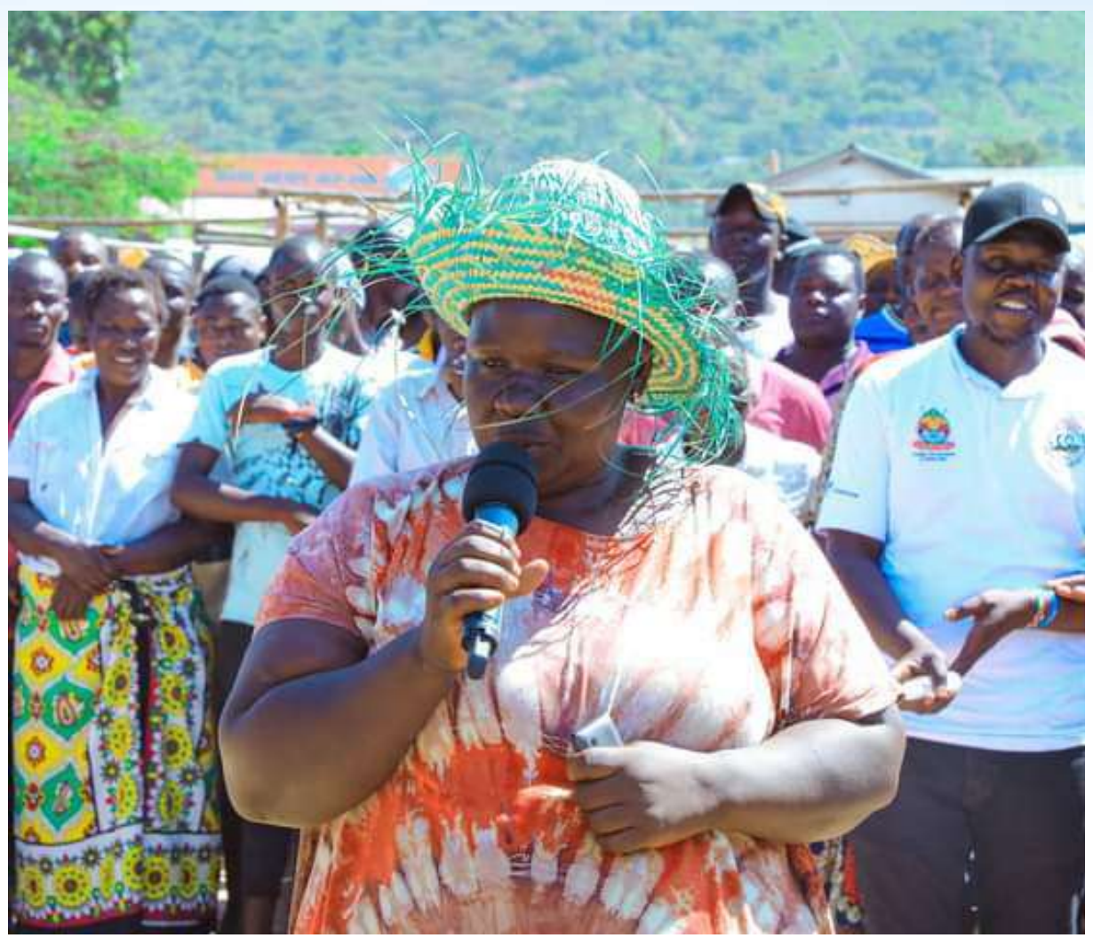
Community representatives giving their views

a refuse collection closet among other businessoriented facilities.