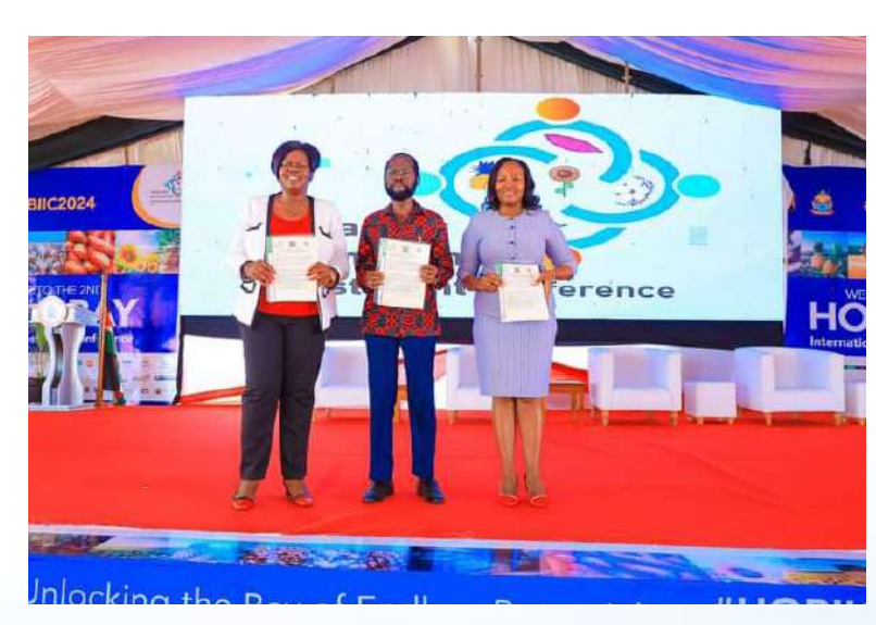
Governor Wanga, Prof. Nyong'o and PS Teresia Mbaika display the copies of the signed communique from the conference

The County Government shall collaborate with the Ministry of Tourism in mapping, packaging and marketing of tourism products within Homa Bay County, and in implementation of the Western Tourism circuit. The County Government shall work with the private sector to encourage investment in the hotel industry within the County.