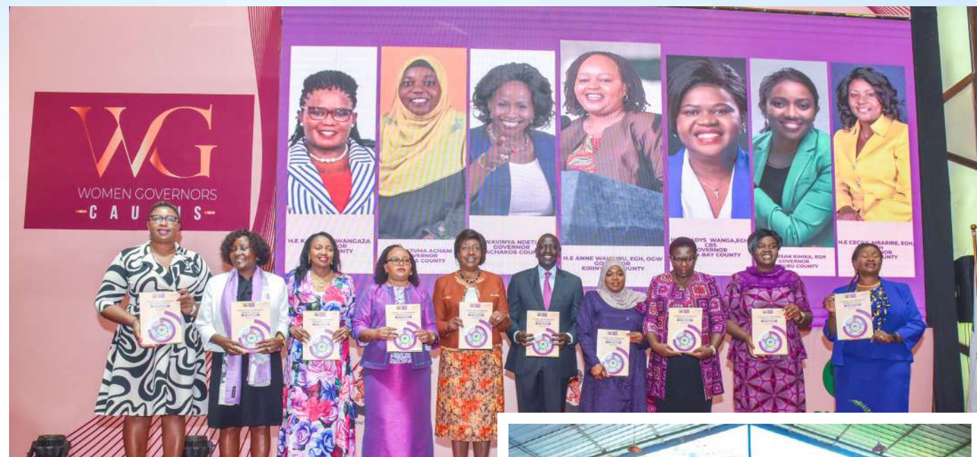
G7 members, and Presidemt Ruto(middle) display copies of the strategy after