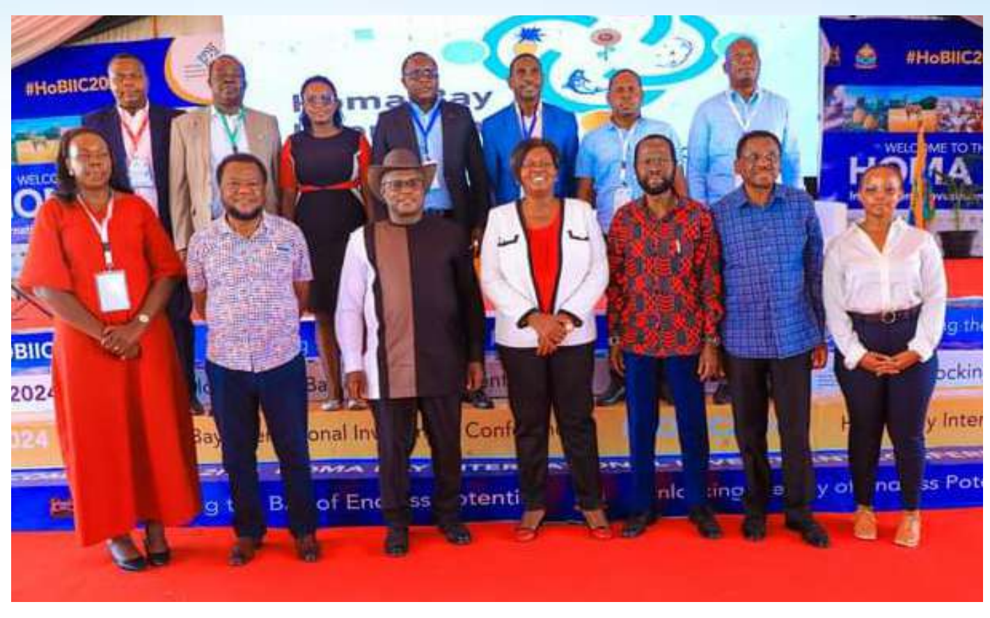
Group photo of the summit and the secretariat of LREB after the discussion on Malaria and Climate Change interface