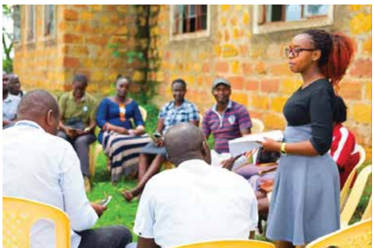
Members of the public following the proceedings at a public participation forum.