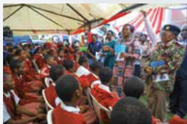
Governor Mentors Girls to Dream, Believe and Achieve. P3