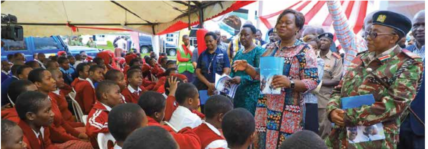
A light moment at the plenary session during the camp.

Ratang'a Girls Secondary School in Ndhiwa hosted this year's Governor's Girls Mentorship Camp, uniting over 5,000 students from schools throughout the county.