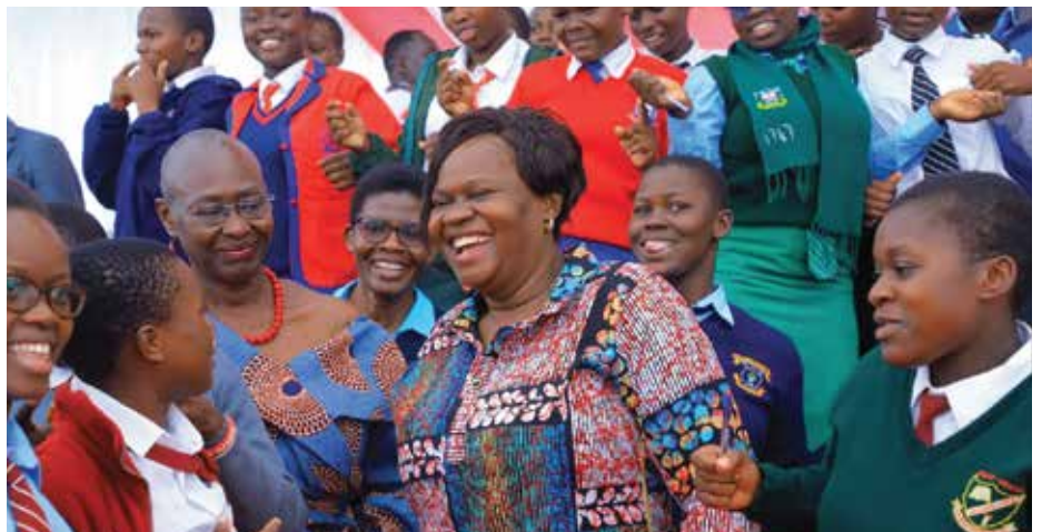
Governor Gladys Wanga conducting a session during the Girls Mentorship Camp at Ratang'a Girls High School.