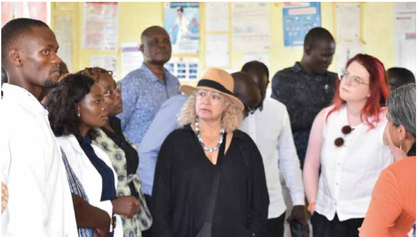
A visit to Ngengu Health Center in Rangwe.

Overall, this visit underscores Homa Bay County's proactive leadership in advancing sexual and reproductive health and rights (SRHR), highlighting the need to establish collaborative pathways to enhance the effectiveness of interventions and improve health outcomes for all residents.