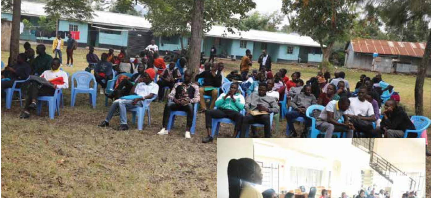
Fundi Mang'ula Scholarship applicant undergoing the verification process.

In collaboration with KCB, the County's Department of Education, Human Capital Development and Vocational Training, concluded the selection process for prospective applicants. The week-long initiative was spread across 19 Vocational Training Centers (VTCs) that offer the program.