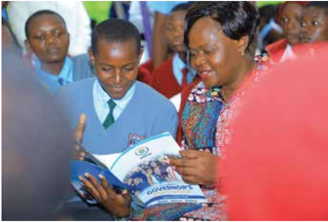
Governor Gladys Wanga sharing a topic with one of the participants.

In 2022 Homabay 274 SGBV cases were reported, of these 190 (97%) were provided with Post Exposure Prophylaxis (PEP) to prevent HIV infection, out of whom 7 (4%) acquired HIV. Additionally, 274 of these adolescents reported being pregnant 4weeks after exposure to SGBV. The Governor has prioritized the Triple Threat through the Women Leadership Caucus which will be part of the mentorship camp.