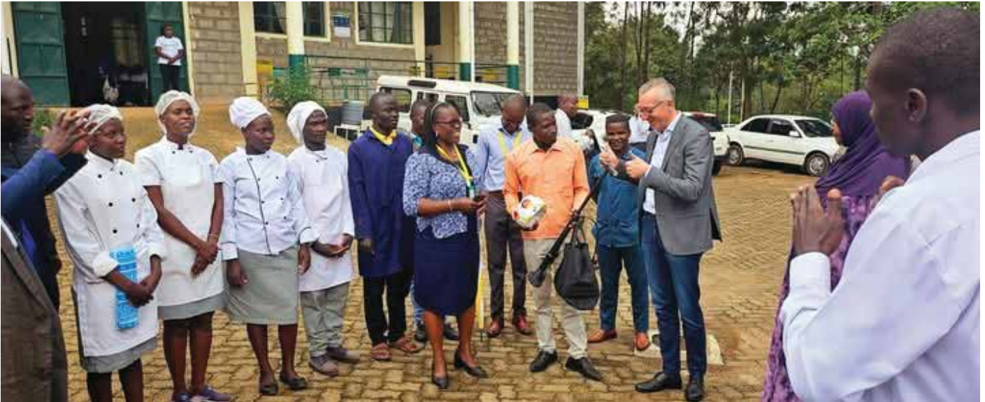
Ambassador Sebastian Groth with students and staff at the Sikri TVET Center.

This project has led to a significant reduction in fuel-related operational costs for women as well as the positive environmental impacts of reducing wood fuel and charcoal consumption.