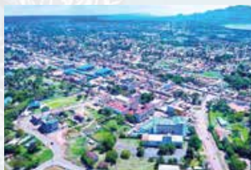
Homa Town Turned a Construction Site. P6