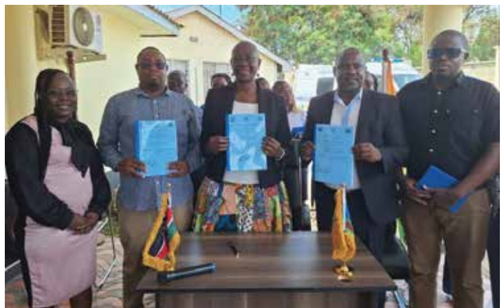
Group photo of the CHMT and development partners after the signing of the MoUs.

This agreement, signed on March 21, 2025, underscores the county's commitment to enhancing healthcare through innovation, research, and community-driven solutions.