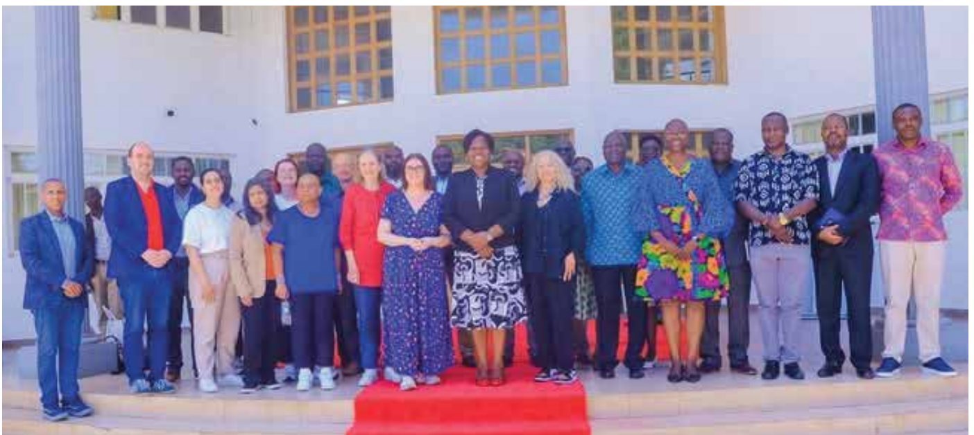
The UK Parliamentarians and County Government of Homa Bay Executive Committee pose after discussions on SRH.