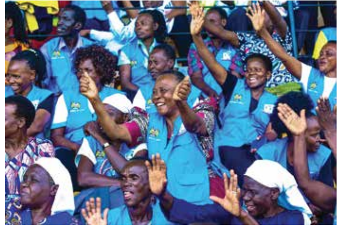
County CHPs at a function to mark the launch of community health surveillance.

Additionally, the county has adopted GIS mapping technology to track pregnant women and ensure they receive timely care. Community Health Promoters (CHPs) play a vital role in reaching out to expectant mothers, encouraging skilled deliveries, and providing follow-up care for newborns.