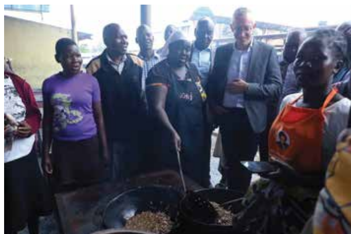
Ambassador Sebastian Groth having a firsthand experience on the working of the energy saving jikos at the Homa Bay Municipal Market.

The bilateral talks between the envoy and the county government led by Deputy Governor Hon Joseph Magwanga leaned on the acknowledgement of the Partnership between the County Government and the German Government recognizing the support of the German Embassy and other stakeholders in implementing the energy-efficient fish fryers projects at the Homa Bay municipal market and the new Modern Fish Market and an emphasis on the County Government's commitment to promoting sustainable energy solutions.