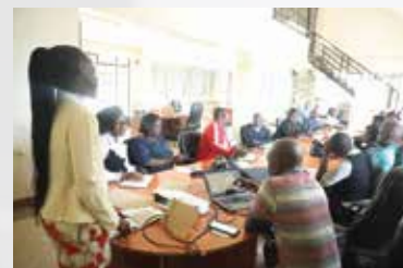
Fundi Mang'ula Season II Begins. P12