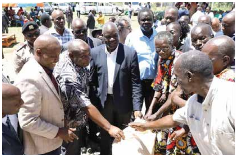
Launch of cotton seeds distribution in West Karachuonyo.