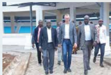
German Embassy Open to More Collaborations. P13