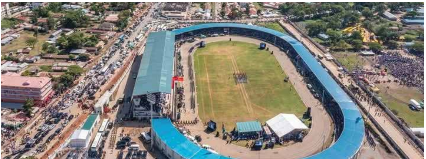
The new look of Raila Odinga Stadium Homa Bay.

Before flying to Rangwe subcounty, where he presided over the opening of the new subcounty headquarters, the launch of construction of the Rangwe-Oboke road, and the Kosiga-Rangwe-Asumbi Water project, the Head of State officially opened the Modern Homa Bay Fish Market that will accommodate more than 400 traders. The new market presents improved facilities such as clean, safe, and adequate spaces, as well as storage facilities like cold rooms for traders. This will enhance fish supply and distribution, attracting related support services, creating employment, hence, stimulating our growth.