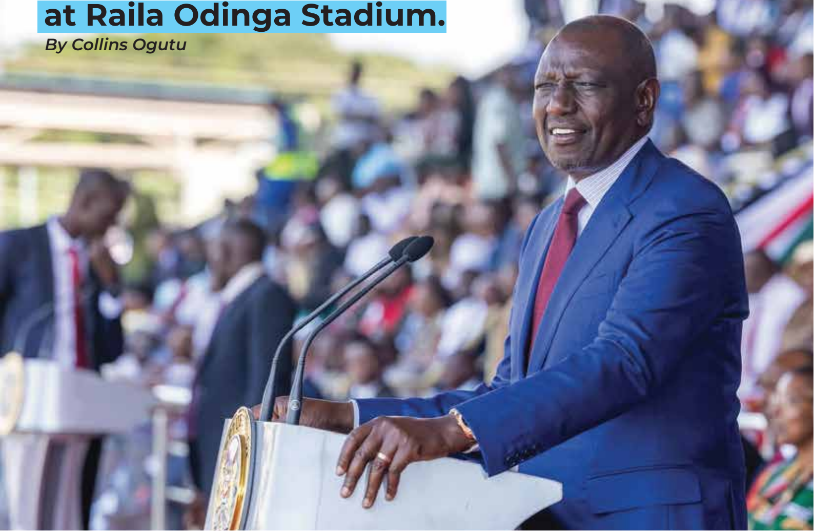
President William Ruto delivering his speech during the Madaraka Day celebrations.

The 62 nd National Madaraka Day celebrations took place with grandeur and patriotic fervour at Raila Odinga Stadium in Homa Bay. Kenyans across the country came together to commemorate this historic day, which marks the achievement of self-rule and independence. The event brought together an impressive array of political leaders, diplomats, local officials, and citizens, emphasising the nation's unity and progress.