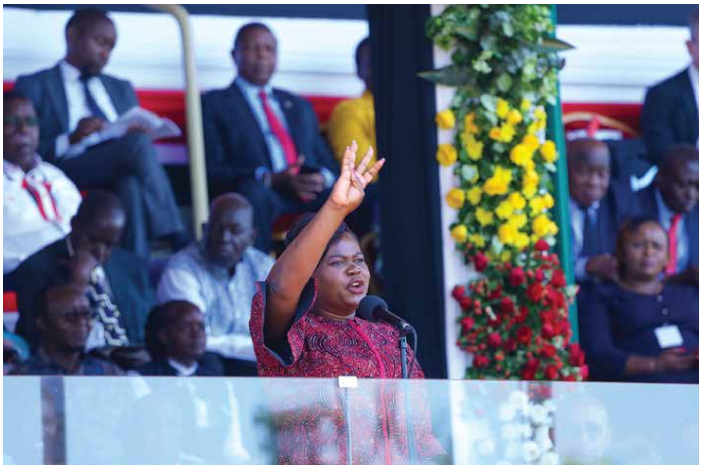
Governor Gladys Wangari appreciating cheers from the crowd during her Madaraka Day celebrations speech.