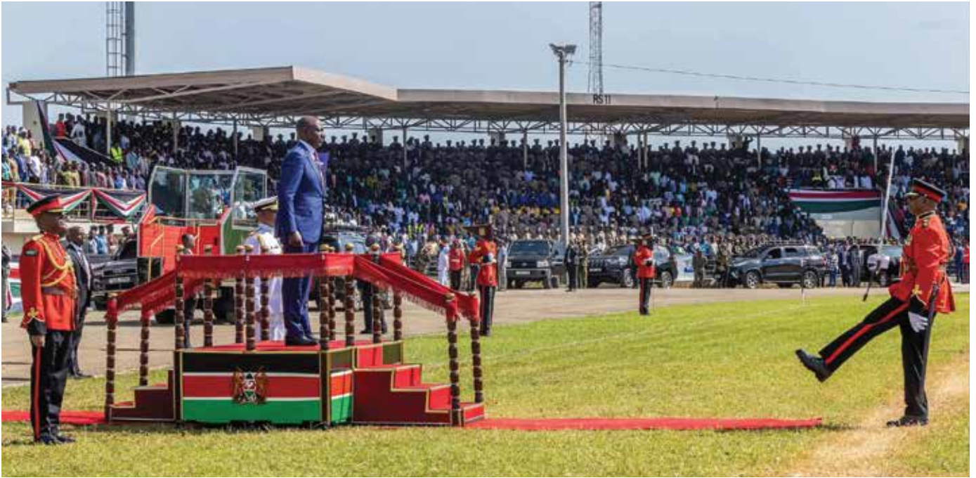
President William Ruto receiving sword salute from KDF Parade Commander.