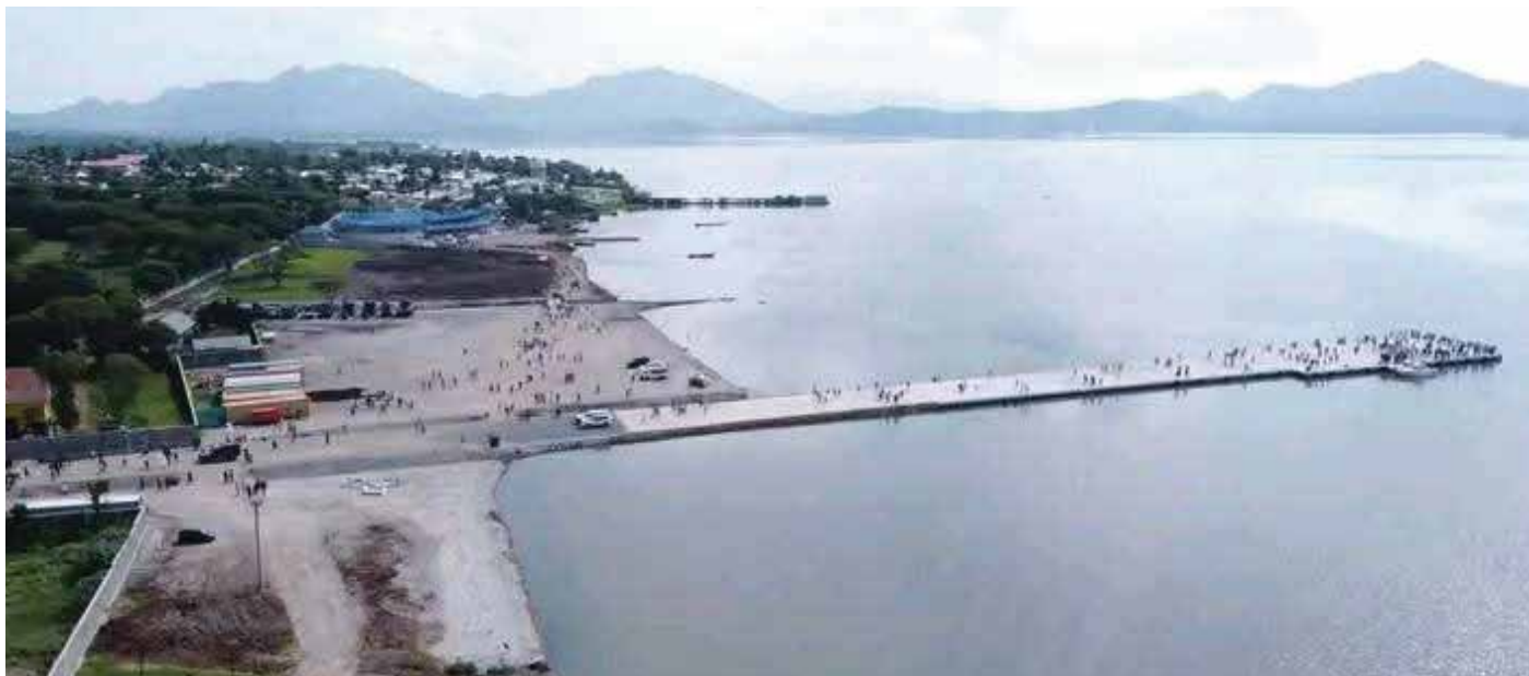
The new Homa Bay Pier.