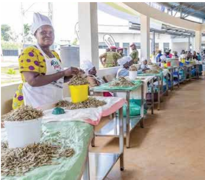
Traders at the new Homa Bay Modern Fish Market

Homa Bay stands at a pivotal moment. With national attention, financial injections, and growing investor confidence, the county has a rare opportunity to solidify itself as a regional economic powerhouse. The coming months will determine whether this momentum translates into tangible benefits for residents or remains a fleeting wave of development.