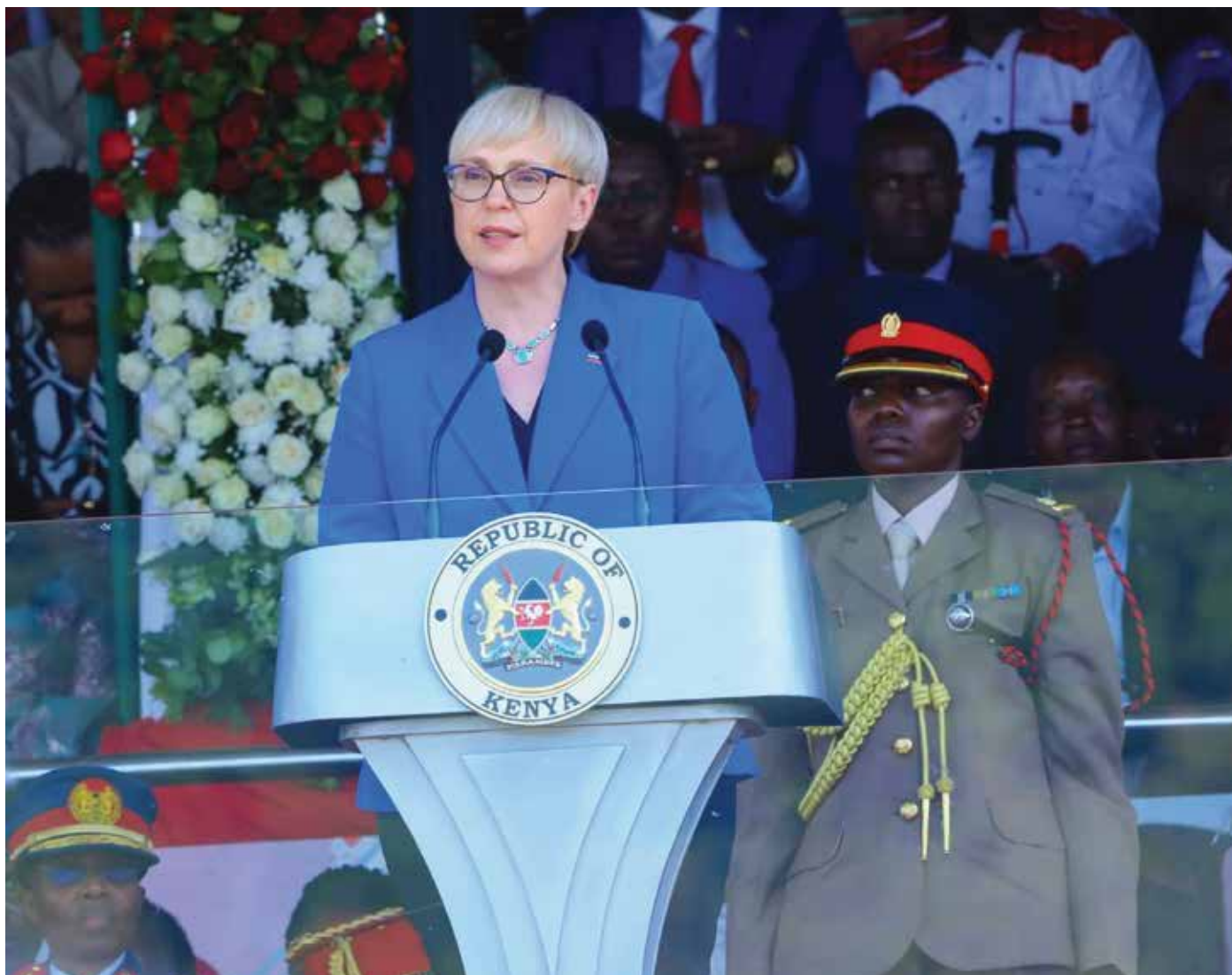
Slovenian President Dr Nataša Pirc Musar addressing the nation at the Madaraka Day celebrations in Homa Bay.

In 2001, she transitioned to the financial sector as Head of Corporate Communications at Aktiva Group. She served as the Director of the Training and Communications Centre of the Supreme Court of Slovenia and was elected the second Commissioner for Access to Public Information in 2004. After a term renewal in 2009, she completed her term in 2014.