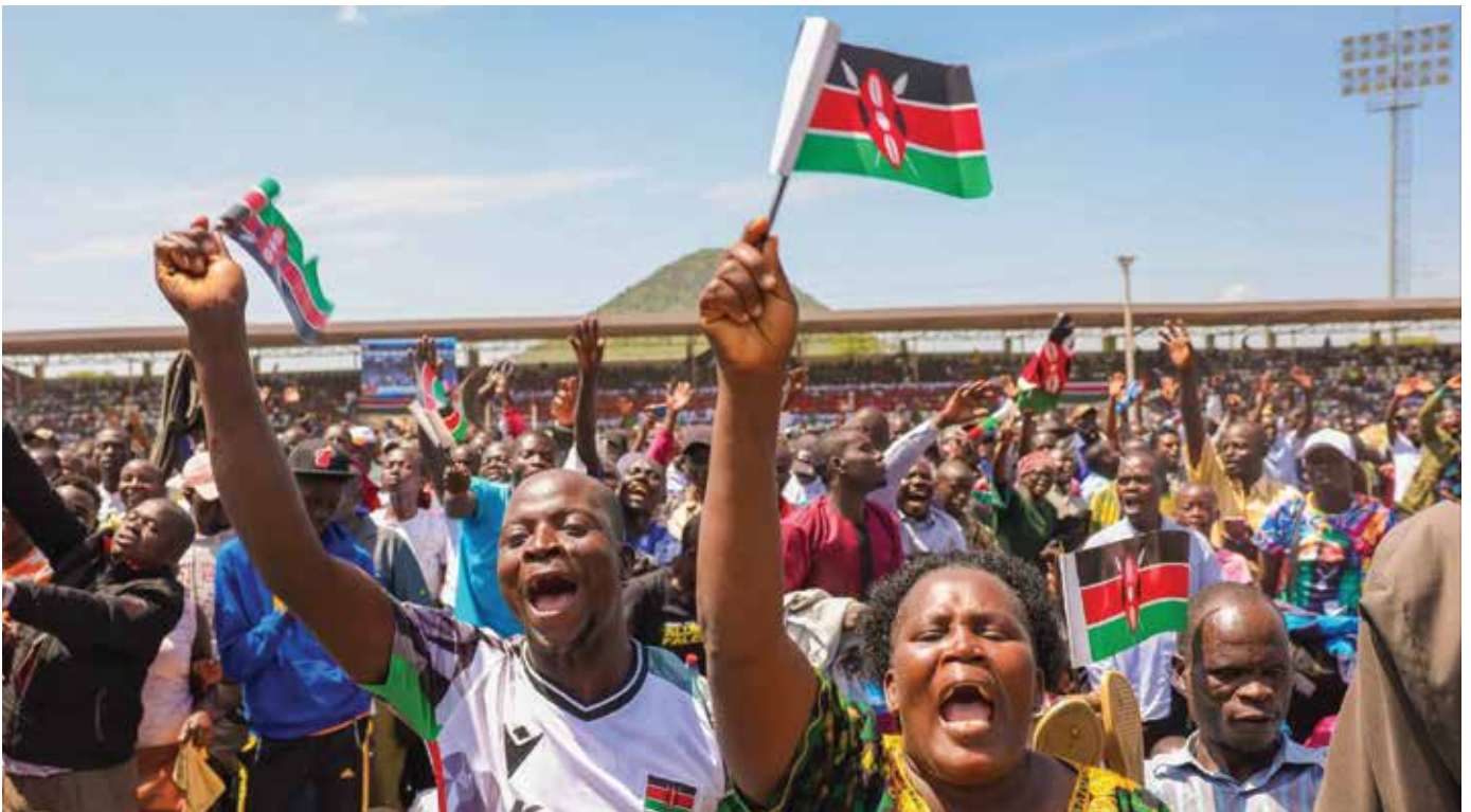
Jubilant Kenyans, waving national flags and dancing, follow the proceedings

President Ruto's remarks called for renewed unity, resilience, and a collective effort to realise Kenya's vision of becoming a middle-income country by 2030.