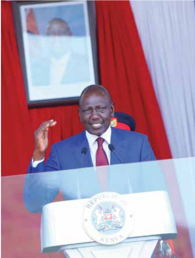
President William Ruto stressing a point during his address at the Madaraka Day celebrations.

P resident William Ruto presided over the 62 nd Madaraka Day celebrations at Raila Odinga Stadium in Homa Bay County, showcasing the unyielding spirit of the Kenyan people. The event drew immense crowds, with Homa Bay residents filling the 12,000-seat stadium well in advance, reflecting the strong public enthusiasm for this significant national event.