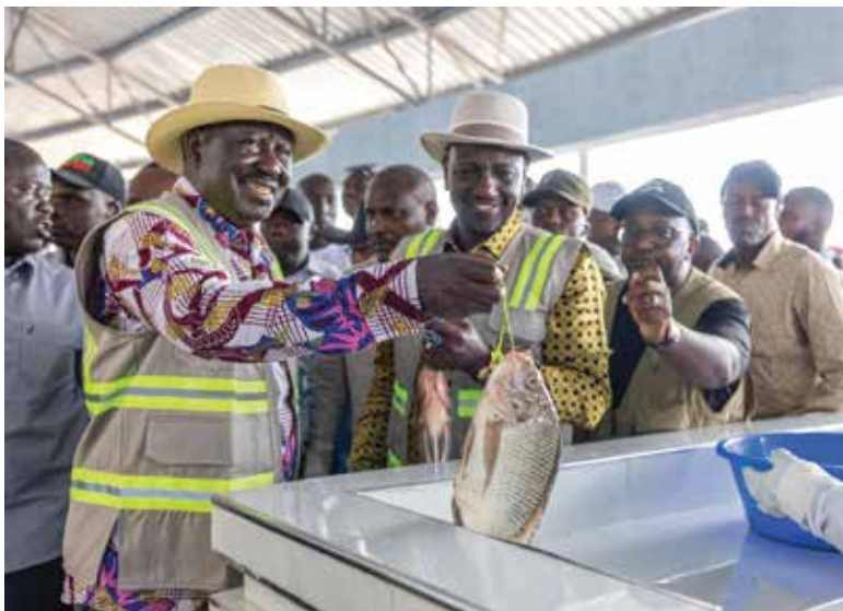
Rt. Hon Raila Odinga and President William Ruto admiring a newly landed fish.

Food vendors, boda boda operators, and informal market traders have seen a 20-30% revenue boost, largely due to the influx of new customers and heightened investor interest.