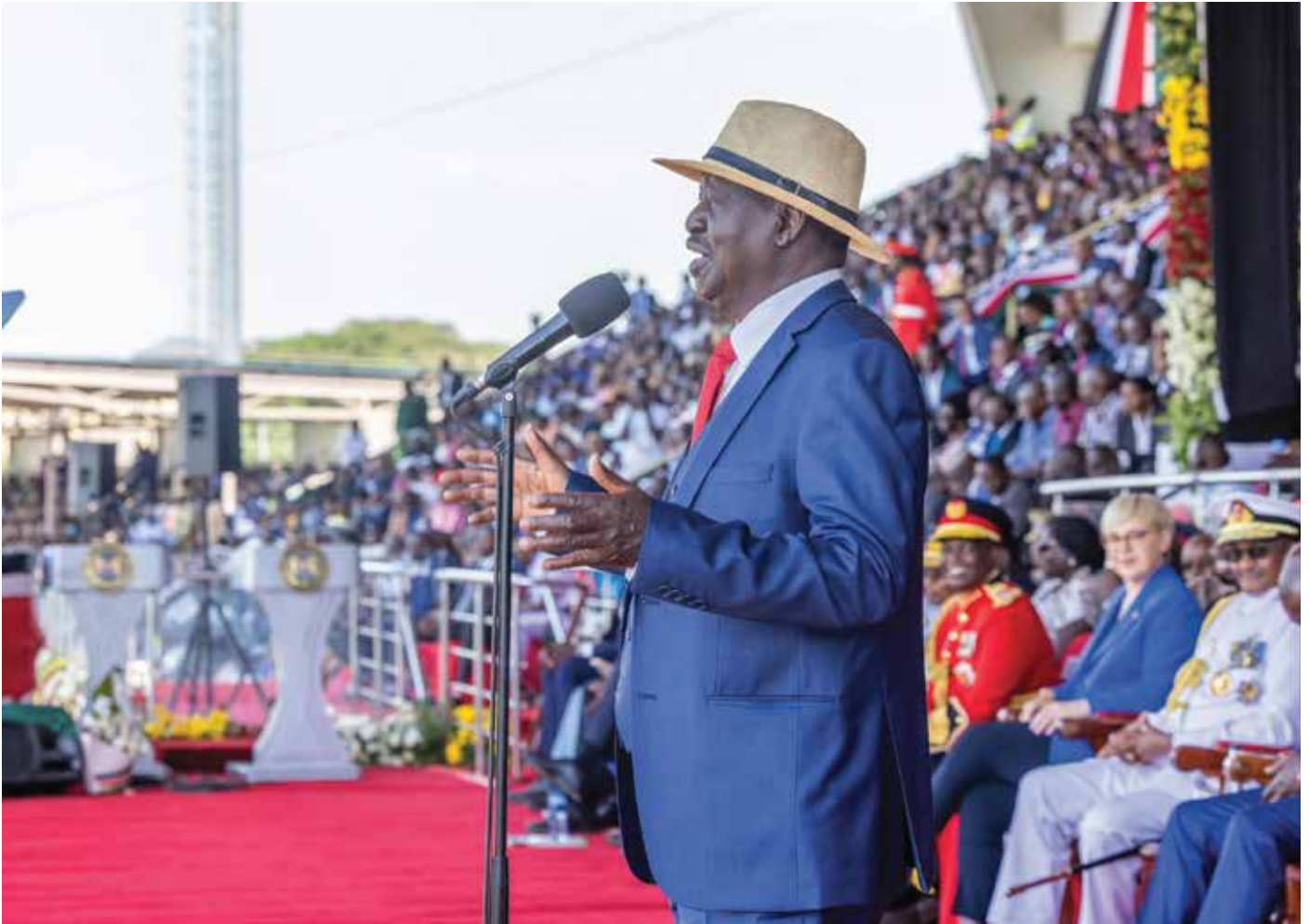
Former Prime Minister Rt. Hon Raila Odinga addressing the celebrations.

The host governor, Gladys Wanga, warmly welcomed all distinguished guests and attendees to the beautiful county of Homa Bay, a region rich in history, culture, and resilience. With heartfelt enthusiasm, she expressed her profound gratitude to President William Ruto for honouring her county by making it the host of this year's Madaraka Day celebrations which is the first time in history that Homa Bay has been chosen for this significant national event.