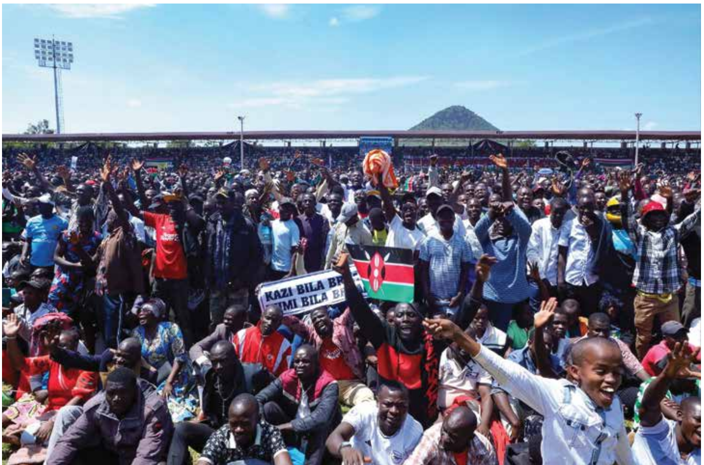
Jubilant crowd cheer on as the leaders address the nation from the stadium's podium.

Thank you all for your cooperation and support. May God Bless Kenya and Homa Bay County!