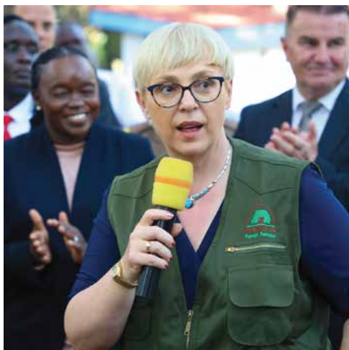
President Nataša at the Wire Forest Beekeeping Farm in Rachuonyo South

Nataša became Vice President and then President of the Europol Joint Supervisory Body, overseeing data protection compliance. In 2014, she was sworn in as an attorney and led her law firm until December 2022. She earned her PhD in 2015 with a thesis on balancing public information access and personal data protection. Nataša served on the Executive Board of the Slovenian Bar Association and began her duties as President of the Republic of Slovenia in December 2023.