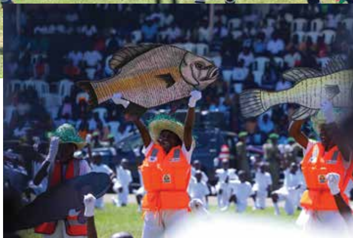
Entertainer displays a model of a fish during the celebrations.

“We have allocated Kshs. 5 billion in grants to aid 100,000 young people, each receiving Kshs. 50,000 in seed capital to kickstart their entrepreneurial journey by August this year, he declared.”