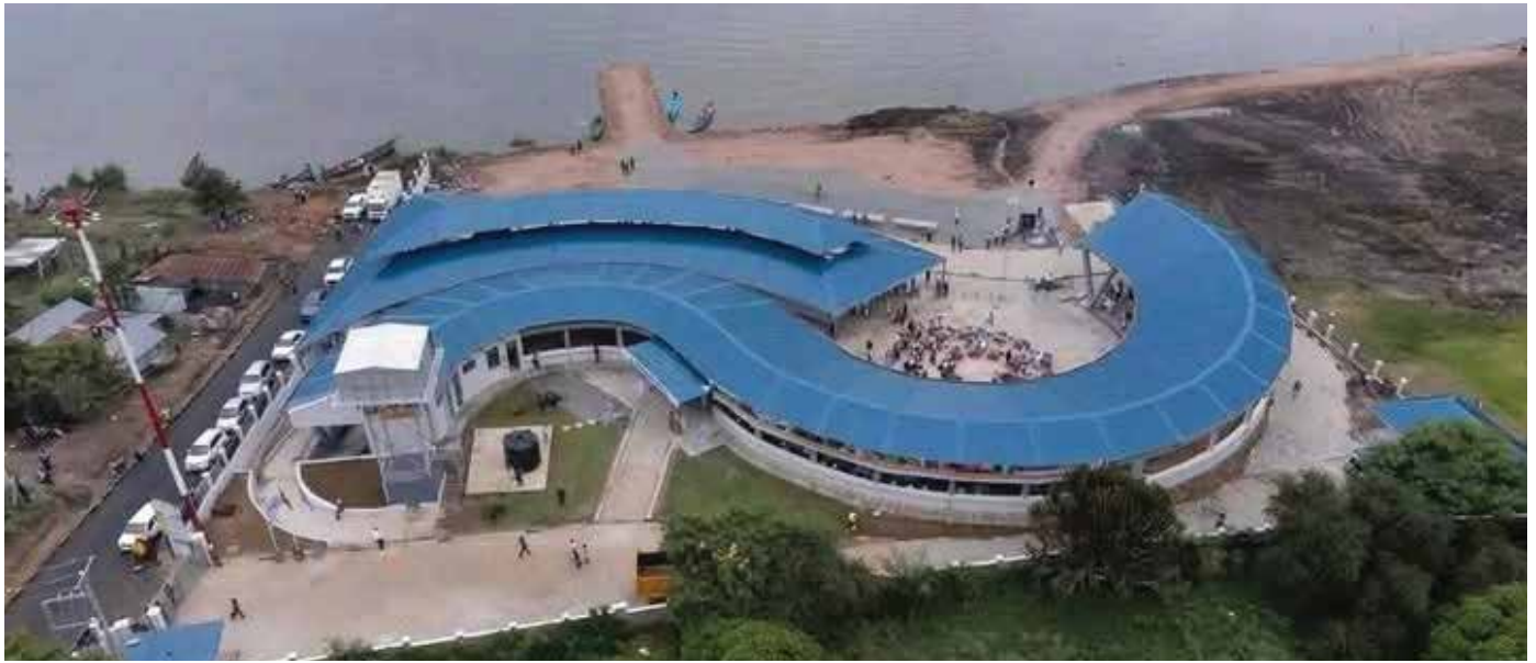
An aerial view of the modern market.

President Ruto also flagged off the Rural Electrification and Renewable Energy Corporation (REREC) to a series of rural electrification projects in the county, aiming for last-mile electricity connectivity that will benefit over 25,000 households and effectively tackle power connectivity issues throughout the region. These projects include 10 direct connections targeting 1,431 households and last-mile connections across the county at KES 90.97 million in the next six months.