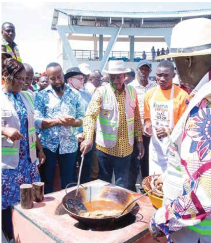
President William Ruto doing a fish deepfrying demo.

The post-Madaraka Day period has seen a notable uptick in business activity, particularly in the hospitality and retail sectors. Hotel occupancy rates surged by 150%, according to hospitality insiders, as visitors flocked to the county following the national event. Small-scale traders, especially those within the Homa Bay Fish and Municipal Markets, have reported increased sales, capitalising on the government-backed push to enhance fish trade hygiene standards.