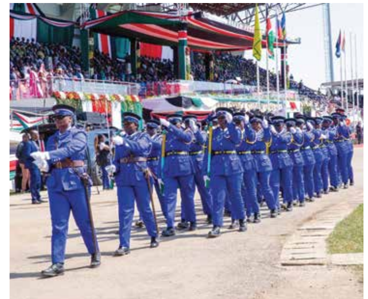
Homa Bay County Enforcement Officers during the pass out parade.

shall put forward to Parliament a reform that ensures any contributor can obtain an affordable home loan of up to Kshs. 5 million, applicable to any housing unit available in the market," he asserted.