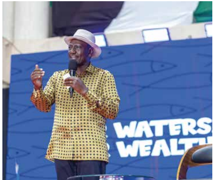
President William Ruto delivering his speech at the summit

President Ruto emphasised that the blue economy could substantially enhance the nation's wealth, food security, and employment opportunities. He noted that this sector, which has been historically overlooked, currently contributes around Kshs. 35 billion to the economy, although its true potential could reach between Kshs. 300 billion and Kshs. 500 billion annually.