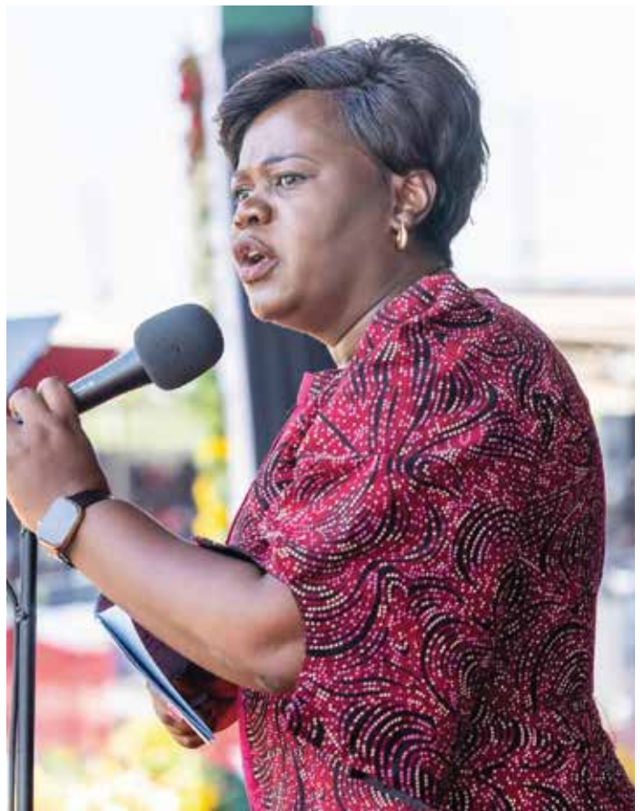
Governor Gladys Wanga takes a moment to welcome celebrants to Homa Bay County

Representation from the legislative branch was strong, with Hon. Moses Wetangula, Speaker of the National Assembly, and Hon. Amason Jeffer Kingi, Speaker of the Senate, playing key roles in the proceedings. The legislative leadership was further complemented by the presence of both Majority Leader Hon. Kimani Ichung'wa and Minority Leader Hon. Junet Mohamed, whose involvement reflected Kenya's diverse political landscape and the importance of bipartisan cooperation.