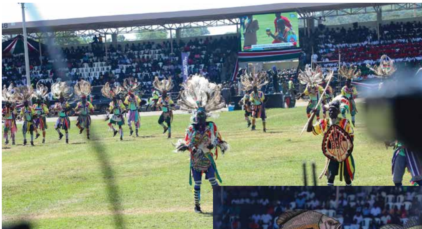
Kagan-Kochia dancers in action.

President Ruto also highlighted the success of the Taifa Care initiative, noting that since its launch in October 2024, 23 million Kenyans have registered with the Social Health Authority (SHA). Over Kshs. 43 billion has been allocated to healthcare facilities, enabling 4.5 million Kenyans to receive fully covered treatments. He announced that 1.7 million informal sector households have enrolled and paid for social health insurance, achieving the highest enrollment rate in a single year in Kenya's history.