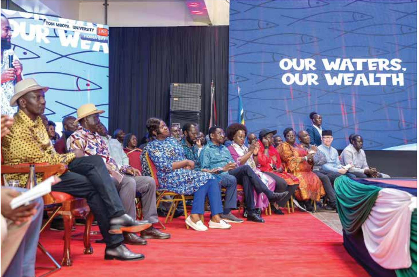
A section of the leaders at the summit

The government is making significant investments in the blue economy to realise the vast potential of Lake Victoria, as highlighted by President William Ruto during the conclusion of the three-day Madaraka Day Thematic Week Summit on Blue Economy and Maritime Affairs held at Tom Mboya University.