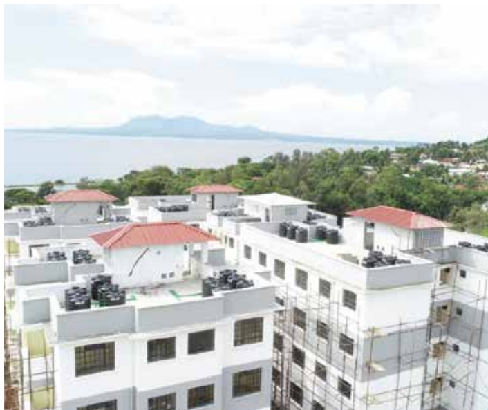
The Homa Bay Affordable Housing Project units