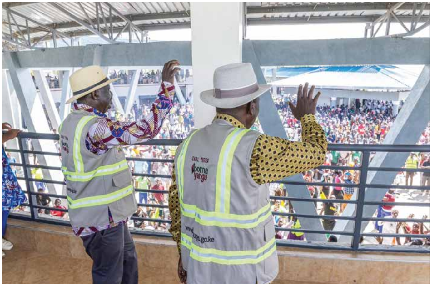
President William Ruto and Rt. Hon Raila Odinga acknowledging a crowd during the opening of the Homa Bay Modern Fish Market.

Still in Ndhiwa, the Head of State laid the foundation stone for the construction of the Ndhiwa Training and Vocational Institute at Ochol in Kanyamwa Kologi. The facility, jointly funded by the Ndhiwa Constituency Development Fund and the Ministry of Education, as well as the County Government of Homa Bay, is expected to be ready by mid-next year.