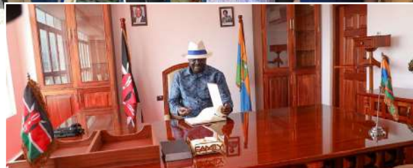
The Rt. Hon Raila Odinga signs the visitors book at the new Governor's Office

The new offices, located off the Homa Bay-Kisumu highway overlooking the bay lakefront is a magnificent piece of architecture, offering an allure into the radiance of the Lake Victoria waters while arching its back to give one another spectacular view of the headquarters of Homa Bay. It will house the Governor's and her deputy's offices, the county treasury as well as all the components of governance and administration of the county government of Homa Bay.