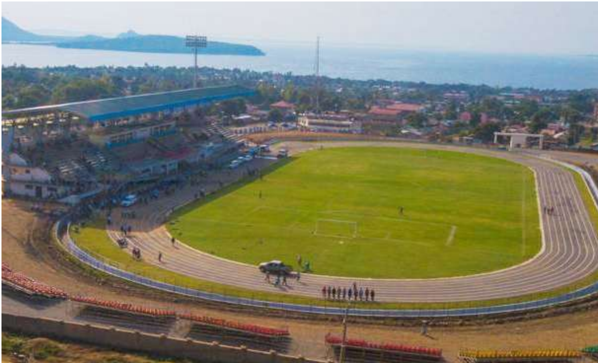
An aerial view of the new Raila Odinga Stadium, Homa Bay with the lakefront in the background

Former Prime Minister the Rt. Hon Raila Odinga officially unveiled the new stadium named after him, giving Kenya's bid for AFCON 2027 a monumental boost.