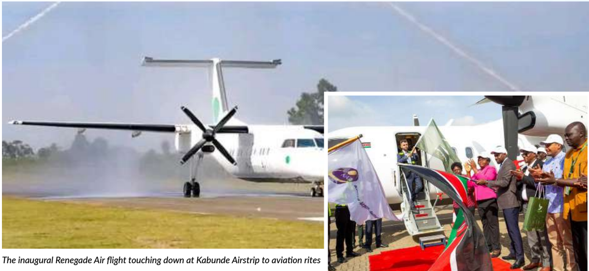
The inaugural Renegade Air flight touching down at Kabunde Airstrip to aviation rites

W e are back with the big boys; we are back with the top league. Homa Bay County resumed being only an hour away from the country's capital, thanks to the resumption of passenger flights between Kabunde and Wilson Airport. Renegade Air is the carrier as you embark on a journey to explore the gem that the County of Endless Potential offers and as you disembark from a journey of a lifetime in the land that heroes – Gor Mahia, Tom Mboya, Odhiambo Mbai, which also boasts the longest freshwater lake shoreline in the region.