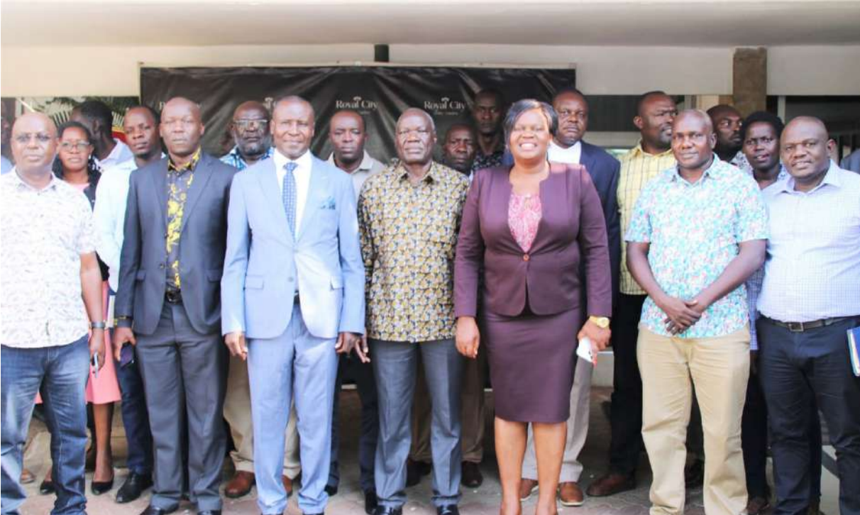
Members of the County Climate Change Steering and Technical Committees pose for a group photo after the opening of the retreat in Kisumu