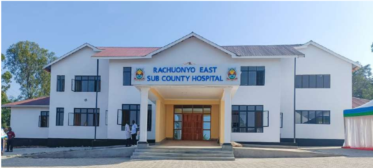
The front view of Rachuonyo East Subcounty Hospital in Ramula