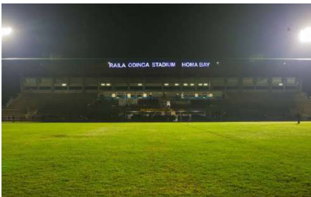
The glitter of the stadium in the night floodlights

With a standard natural turf, an immaculately demarcated track, and three floodlight masts, the stadium is ready to host both local and international sporting events, besides possessing the ability to host social events owing to its spacious dais covered by an imposing roofed canopy.