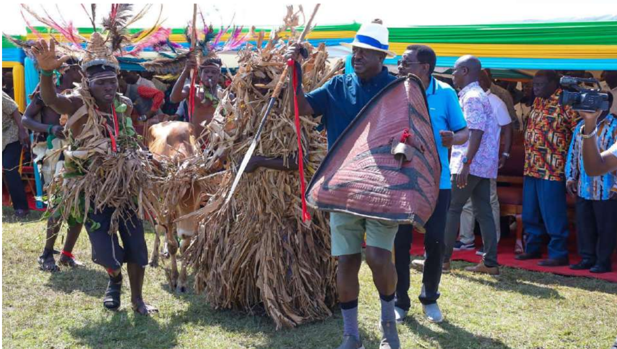
The Rt. Hon Raila Odinga leads the way in tero buru at Achich Beach

N ever before in recent times has the Luo Nation had an opportunity to gather together in hope and happiness as happened in Homa Bay County on June 30 and July 1, 2023; and Gor Mahia's solitary goal against Luo United in a fully packed Raila Odinga Stadium offered a climax to remember at the Piny Luo Festival