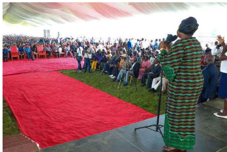
Governor Gladys Wanga give opening remarks at the onset of the Piny Luo Dialogue