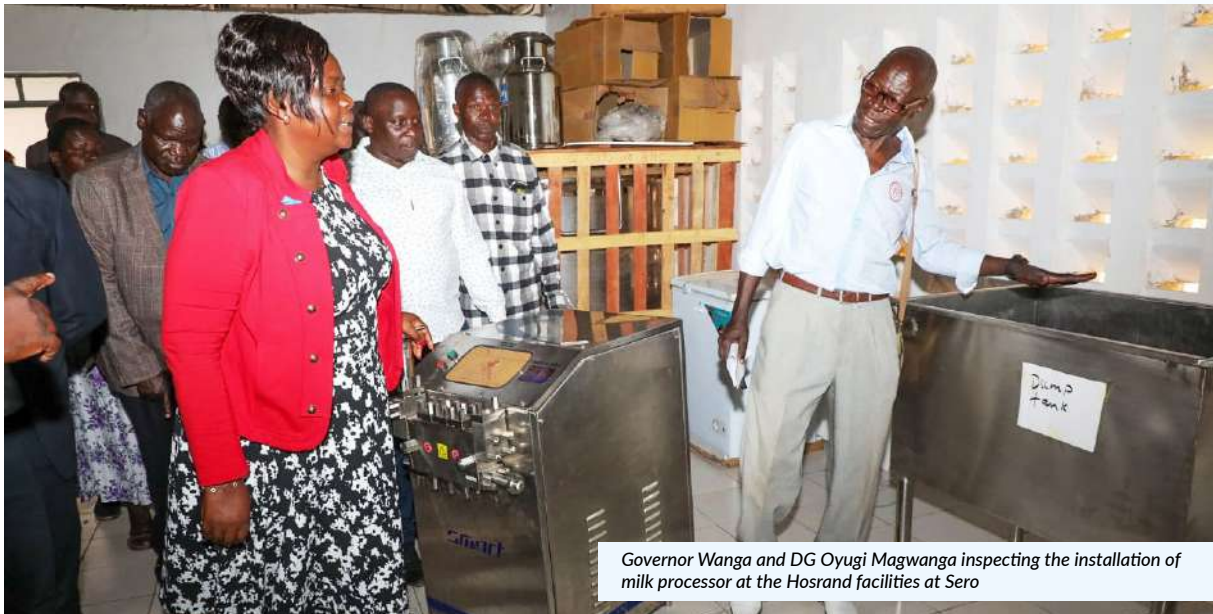
Governor Wanga and DG Oyugi Magwanga inspecting the installation of milk processor at the Hosrand facilities at Sero

A griculture cooperatives play a key role in enhancing productivity and access to markets for smallholder farmers. Most farmers' cooperatives in Homa Bay have attempted to establish inputs distribution systems for their members to access quality inputs and secure markets that offer fair and premium prices. However, most of these systems have weaknesses, lacking clear farm inputs purchase, supply structures, and market linkages. This results in low incentives for the members since the cooperative-owned outlets do not offer competitive products and prices. By understanding the market demand, a cooperative would be better placed to provide its members with improved access to seeds, inputs, fair pricing, and delivery of diverse agricultural products and services.