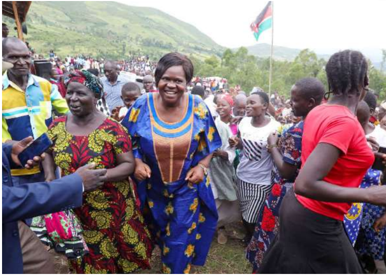
Governor Wanga is escorted by jubilant residents of Nyakoria to the site of the new school