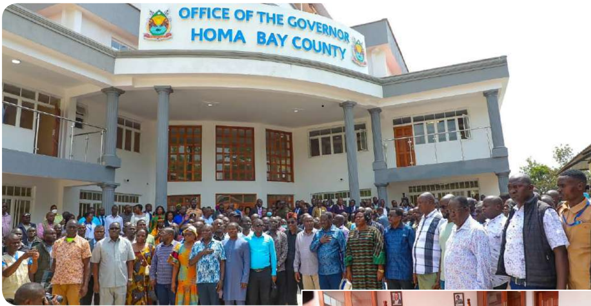
A group photo of leaders who witnessed the unveiling of the new offices

The new Homa Bay County Governor's office block is finally opened in pomp and color at a ceremony presided over by former premier Rt. Hon Raila Odinga.