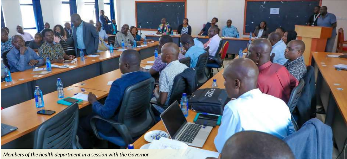
Members of the health department in a session with the Governor

M odern governance, administration, and service delivery is a business that strives for efficiency to keep pace with the competition. For all of the technical proficiency and automation that we have come to rely on, it is still people who run the government, making it all the more important to get the best effort from your employees, and increasing their productivity must top the list of the employer's priority.