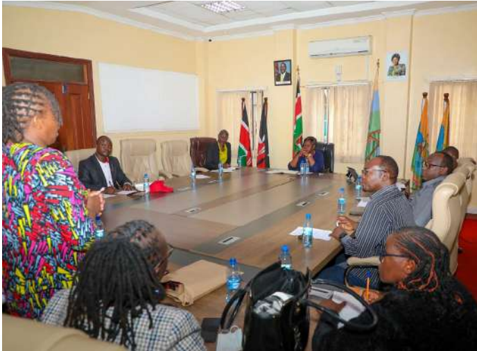
The boardroom meeting where a deal to work together on disaster response and mitigation was sealed

Regarding health emergencies, the county government and the Society will embark on training and equipping the community health workers on first aid, disease detection on the first account, data capturing and remittance, and health awareness so they are ready for whatever eventualities in their localities. The two institutions will also work closely on water and sanitation, common diseases vaccinations, and child malnutrition as well as revamping the campaign to have more residents register for the National Health Insurance Fund plan.