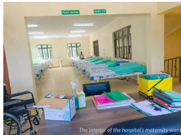
The interior of the hospital's maternity ward