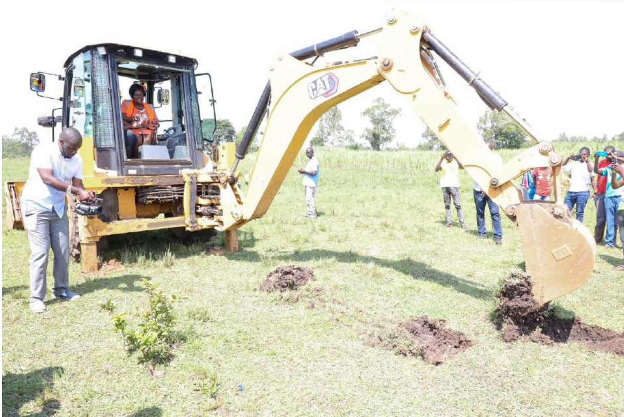
The groundbreaking at Thome, Kanyamwa Kosewe in Ndhiwa