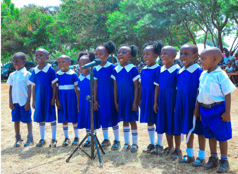
Pupils of Uwii Primary School in Gembe recite a poem during the Poccasion of the launch classroom construction

A historic moment unfolded on Wednesday, 10th July 2024, as Governor Gladys Wanga, in collaboration with her government and education stakeholders, inaugurated the Genowa Ondoa Kaunda Classrooms Initiative at God Ndonyo Primary School in Kibiri Ward. This transformative undertaking symbolized a commitment to building 160 state-of-the-art classrooms, a significant leap forward from the previous administration’s efforts.