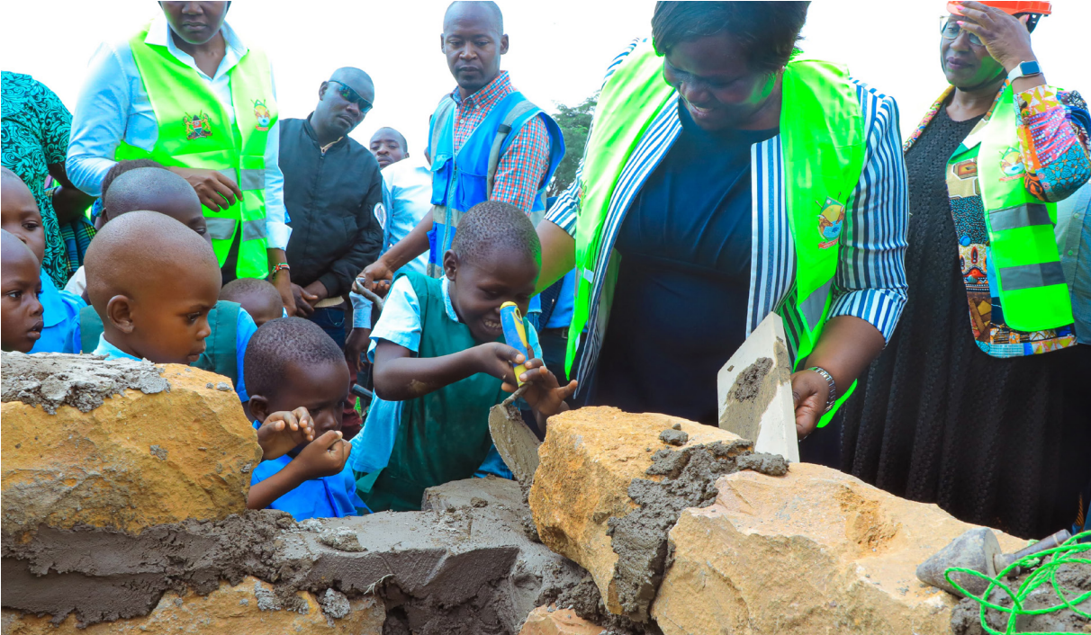
Governor Wanga admires young Mitchell of God Ndonyo Primary School as she puts a layer to mark the launch of Ondoa Kaunda Classrooms Initiative

On a momentous day at Yiembe Primary School in Kanyamwa Kosewe, the air was filled with excitement as pupils eagerly awaited a special guest. The sound of jubilant songs and cheers echoed through the school grounds as they anticipated the unveiling of a brand-new, modern four-classroom block to replace the old, rundown mabati structure that had been a longstanding eyesore at the school.